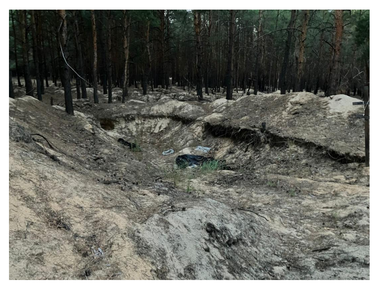
Exhumed mass grave outside Izium